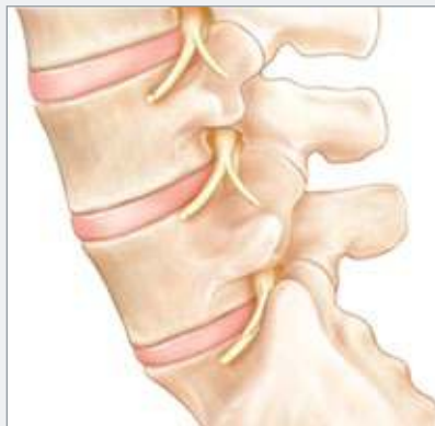
Normal spine segment

Typical symptoms include low back pain, muscle spasms, thigh or leg pain, and weakness. Interestingly, some patients are asymptomatic and only learn of the disorder after spinal X-rays.